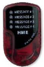
4 Lite Pager