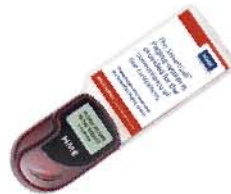
Alpha Numeric with Paddle Pager