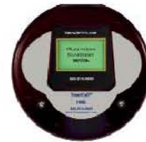
SmartCall Coaster Pager