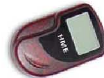
Alpha Numeric Pager